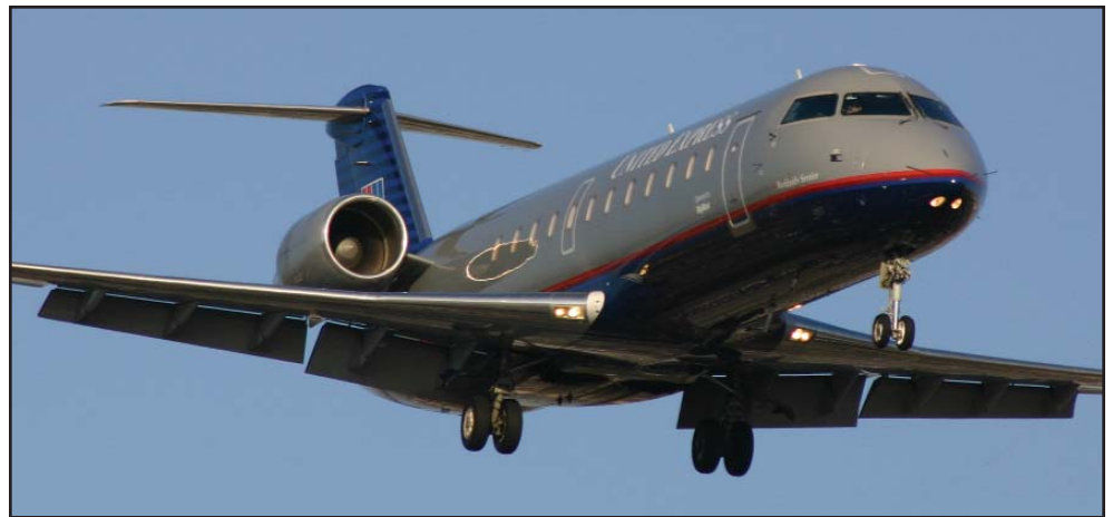
NEW CARRIER UNITES DAYTONA BEACH, WASHINGTON Nation's second largest airline now offers nonstop service to Washington - Dulles