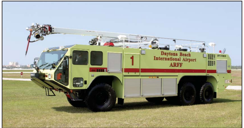
ADVANCED LIFE SUPPORT UPGRADE AT DBIA Volusia County Fire Services' DBIA station adds service for airport and surrounding area

The upgrade to ALS means the structural engine will be staffed 24-hours-a-day