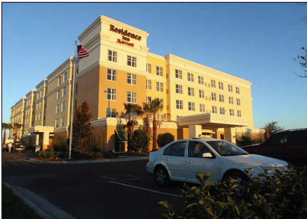
A NEW 'RESIDENCE' FOR VOLUSIA COUNTY VISITORS Airport's third hotel property opened in time for Speedweeks 2006